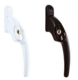
STANDARD black, white, satin stainless or polished chrome