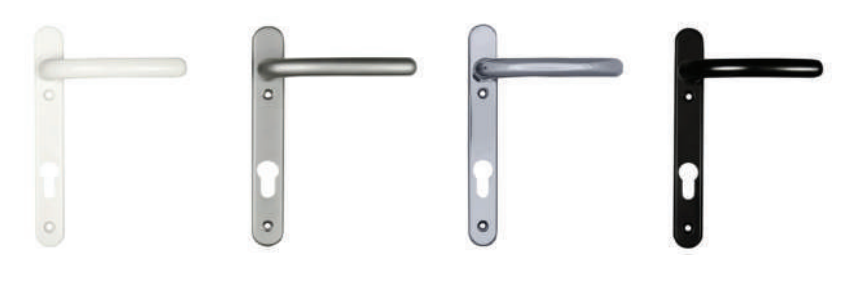
LEVER LEVER - STANDARD