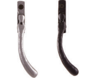
MONKEYTAIL - UPGRADE