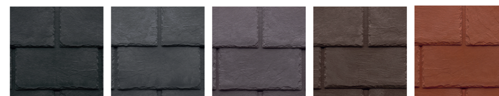
Stone Black Pewter Grey Plum Chestnut Brown Brick Red

TapcoSlate tiles are authentically shaped with textured surfaces and riven edges moulded from authentic slates that make them indistinguishable from natural slate. It is made from a recyclable blend of limestone and polypropylene. TapcoSlate tiles will not crack, break or delaminate, and its product formulation and manufacturing processes provide durability, performance, and longevity for many years. The TapcoSlate tiles come with a 40 year warranty and 5 standard colours as well as 9 alternative colours.