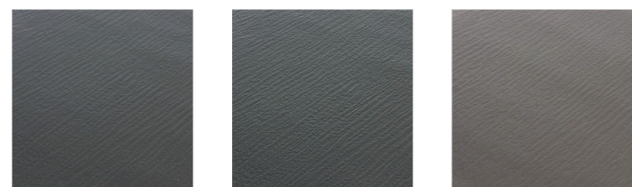
Anthracite Black Slate Grey Dark Brown

A flat, precision manufactured, recycled polymer, lightweight roof tile with excellent green credentials. This lightweight roof tile is extremely simple to fix yet performs exceptionally, locking into adjacent tiles to form a fully integrated roof covering. Envirotile is 80% lighter than concrete roof tile, is low maintenance, virtually unbreakable and manufactured in the UK. It is available in a choice of 3 colours and comes with a 25 year warranty.