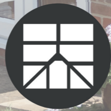
Edwardian or Georgian