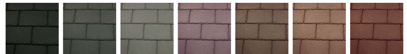
Charcoal Ash Slate Grey Amethyst Oak Sunshine Sunset

Britmet's Liteslate is an innovative synthetic slate roofing tile made from 90% recycled polymers with all the characteristics you can expect from a traditional slate tile. Liteslate offers an authentic finish with riven edges, traditional colour choices and impeccable durability. Unlike natural slate, as a synthetic slate roofing tile, Liteslate won't crack, break, chip or delaminate due to its ground-breaking design and cutting-edge manufacturing process. Furthermore, the Liteslate is designed with the environment in mind. Over 90% of the Polymers that Liteslate is made from are recycled. Available in 7 colour finishes with a 40 year guarantee against weather penetration.